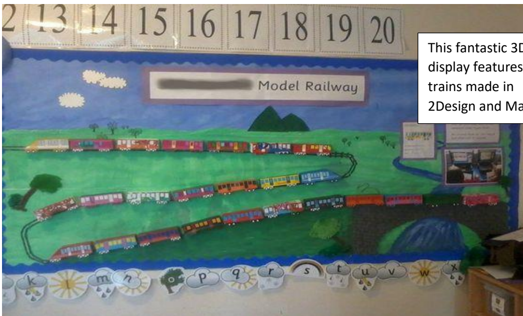
This fantastic 3D display features trains made in 2Design and Make.