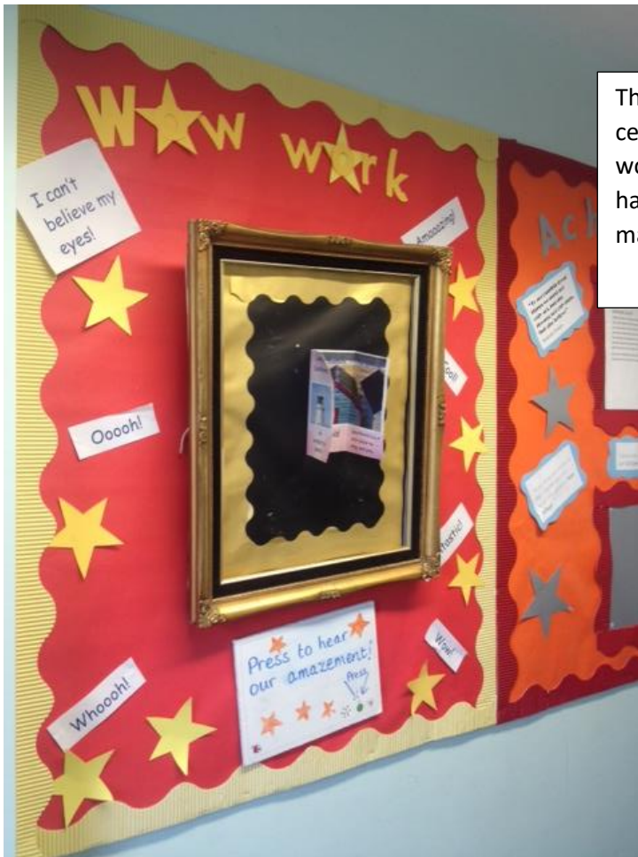
This 'WOW WORK' display celebrates exceptional work, which just so happens to be a leaflet made in 2Publish!

Here are two examples of wall displays that feature Purple Mash. We can't wait to see what you come up with.